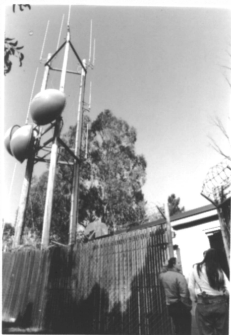
The vault sits next to the tower. The SCCARA antennas will be located atop the pole closest to the foreground (center) in this view.