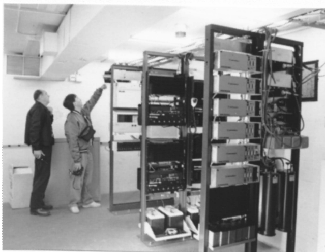
Club members inspect the vault that our repeater will be sharing with other equipment. This room houses six public safety repeaters and three microwave receivers of the city (which connect base stations to com-center), plus misc. county gear.