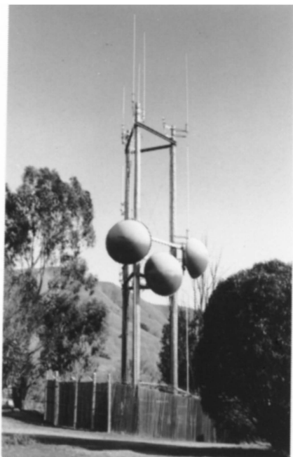
In Alum Rock Park, the radio installation and its antenna complex are perched on Eagle Rock, about 750 ft. above the valley floor.